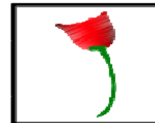
Fig. 1 Denotation

It studies the relation between signifiers, like words, phrases, signs, and symbols, and what they stand for, their denotation. An example is shown in Fig. 1.